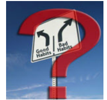
Take the right direction

Is 2012 the year your life changes forever? empower yourself